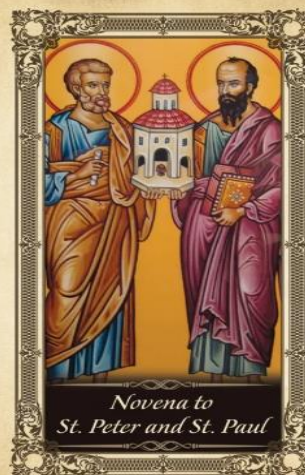
Novena to St. Peter and St. Paul

IN EVENT OF RAIN , please visit catholic-cemeteries.com