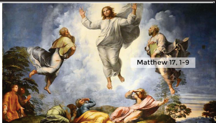
Matthew 17. 1-9