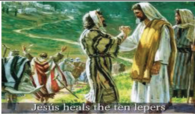
Jesus heals the ten lepers