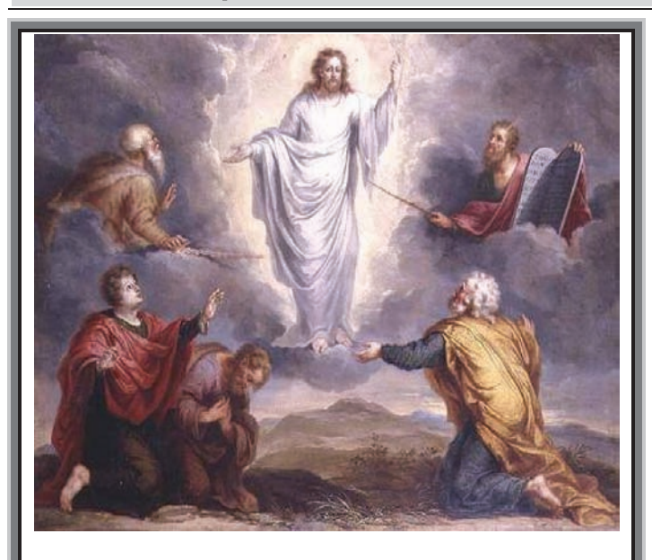
First Reading: Genesis 15:5-12,17-18

God makes a covenant with Abraham, promising him many descendants.