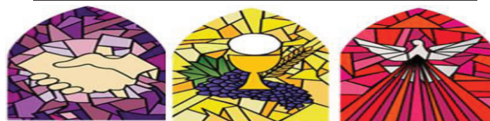
Reconciliation | Communion | Confirmation